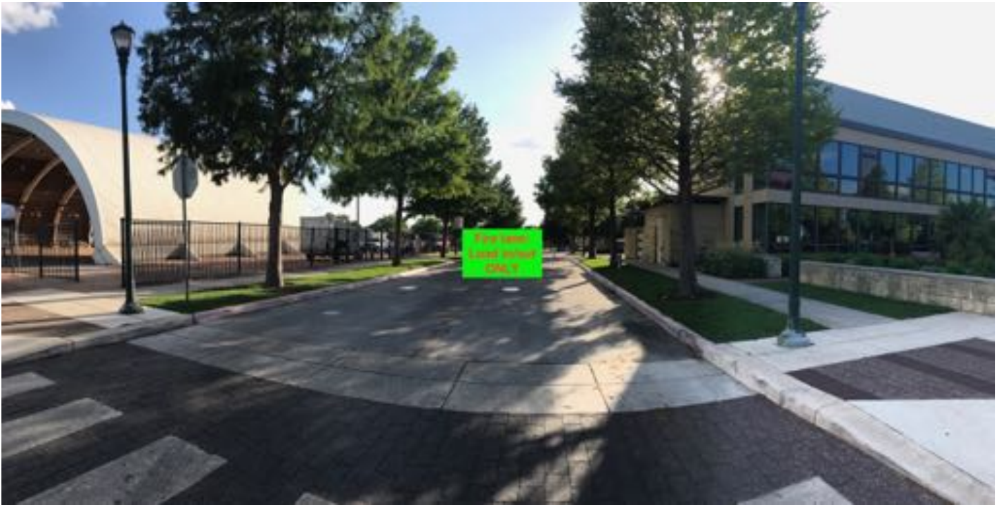
Fire lane: Road to the West of Hangar. Monitored by Fire Marshall. NO VENDOR PARKING.