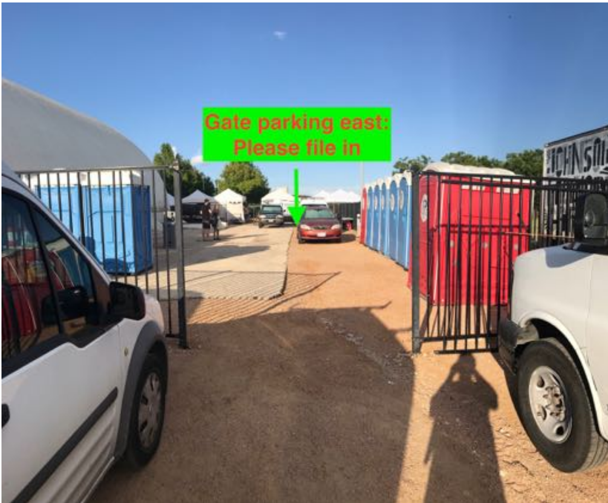
Gate parking East: Vendor parking permitted behind gates to the East of the hangar. Vendors MUST file in and make as much room as possible, no blocking entrance by filling gravel parking first (see below).