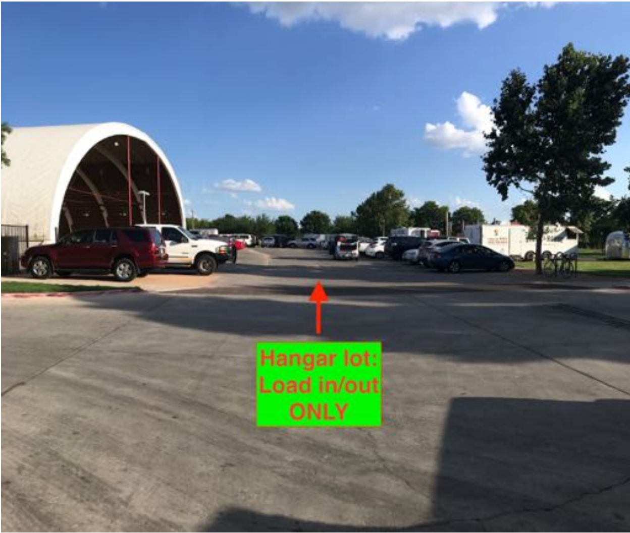
Hangar lot: Shopper parking located directly behind the Mueller hangar (in front of food truck court). NO VENDOR PARKING.