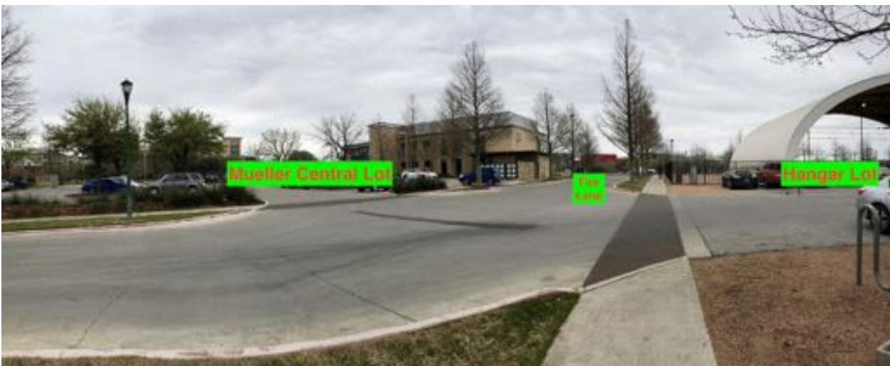
Mueller Central lot: Shopper parking located directly behind the Mueller central building (parking lot to the West of Hangar lot). NO VENDOR PARKING.