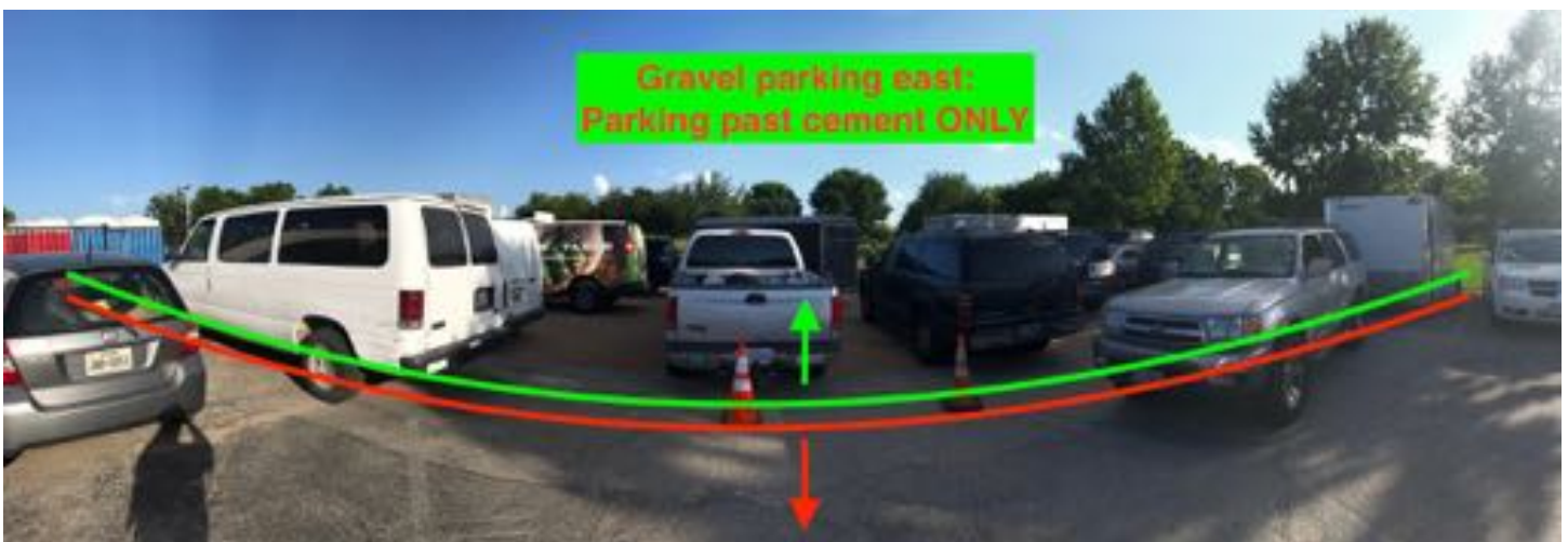
Gravel parking: Vendor parking permitted behind in gravel only between gates around portable restrooms and TFM trailer and dumpster. Vendors MUST file into Gate parking East first and make as much room as possible, no blocking entrance to gate parking. DO NOT PARK ON CEMENT.