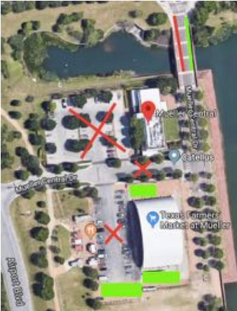
Above: Vendor parking overview

It is essential that vendors follow parking rules. These areas are heavily monitored by TFM staff and vendors who do not follow vendor parking rules will be fined $30 without warning.